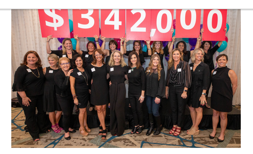
More Big Reveal Photos - Click Here!